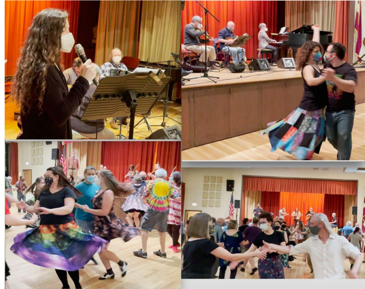
Collage provided by Sherry Nevins