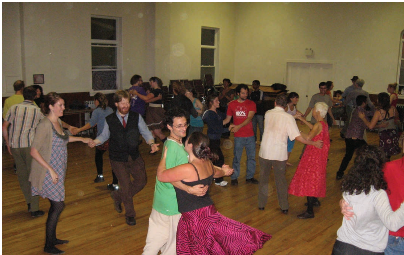
Halifax Contra Dances, October 2012