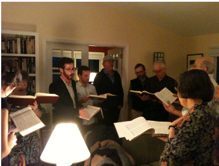
Singing at the Thursday night potluck