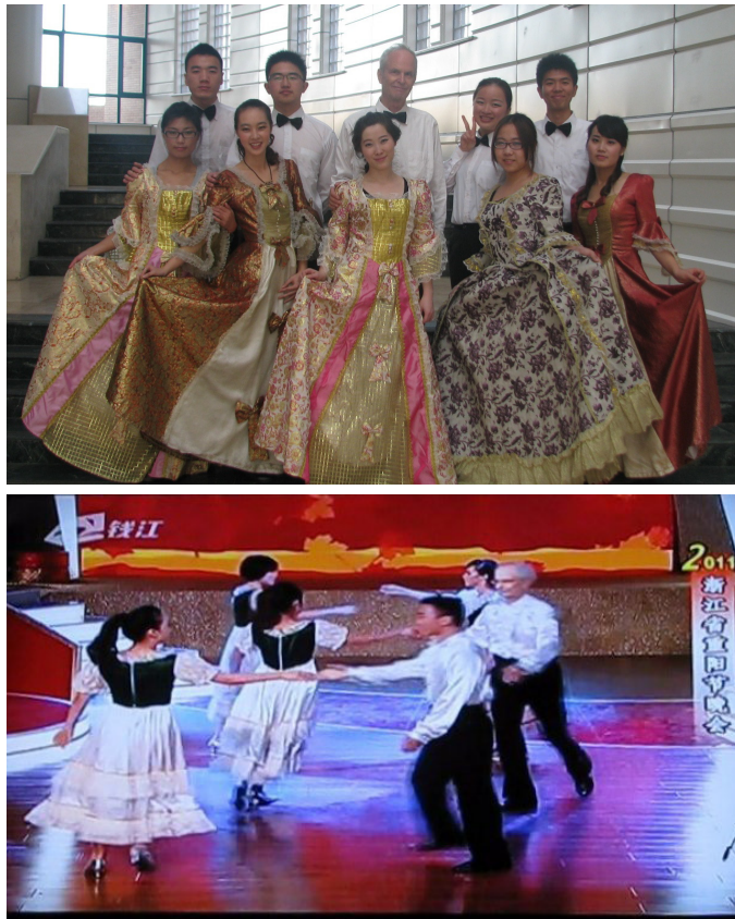
Dressed for a performance on campus (GW standing center back); performing Leather Lake House on Chinese television; photos courtesy the author.

I was sad to have to leave China and this dance project, which seemed to be just getting off the ground, but I was delighted that some of the dancers I left there held their own little 2013 New Year's ECD Ball without me and reported that they had a wonderful time. I'm hoping in the future they will find ways to keep alive the joy that they discovered in English country dancing.