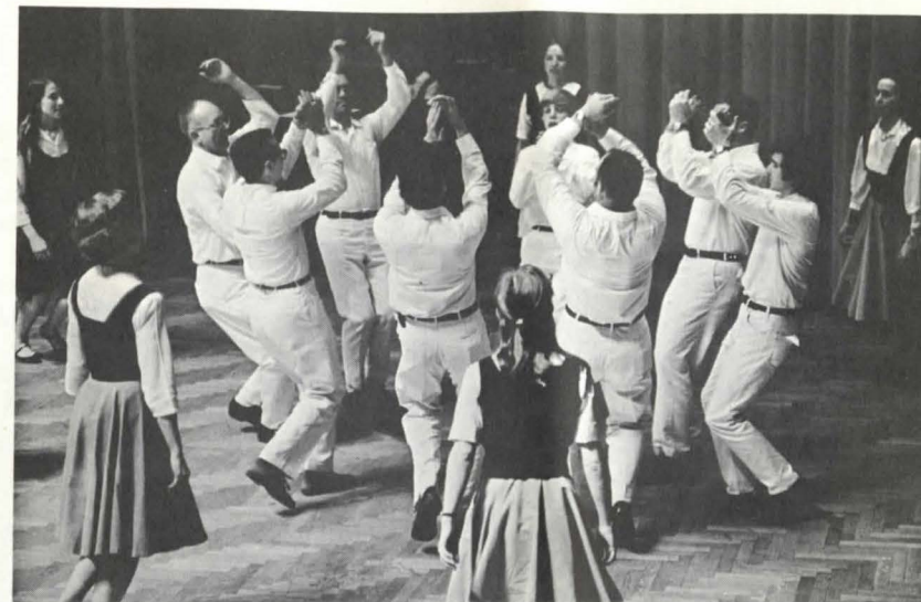
BOSTON CDS CENTER DANCERS performing at the National Convention of the AMERICAN ASSOCIATION OF HEALTH, PHYSICAL EDUCATION AND RECREATION, held at the Hotel Statler, Boston, April 1969.