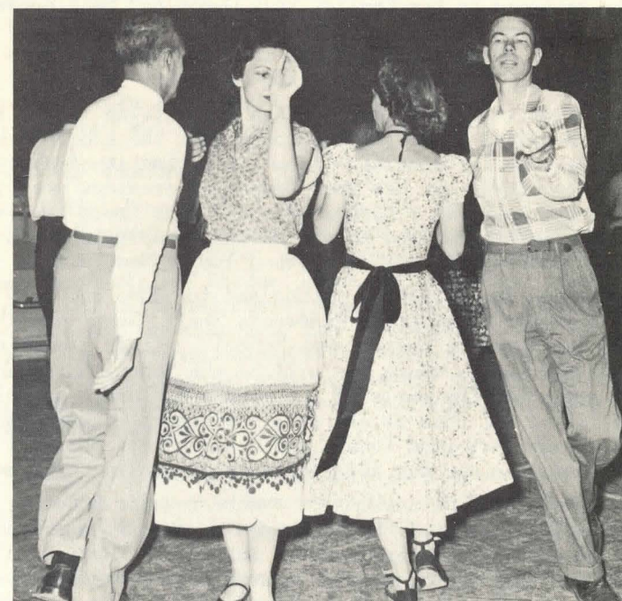
Members of the Fairfield Country Dancers at the Connecticut Festival