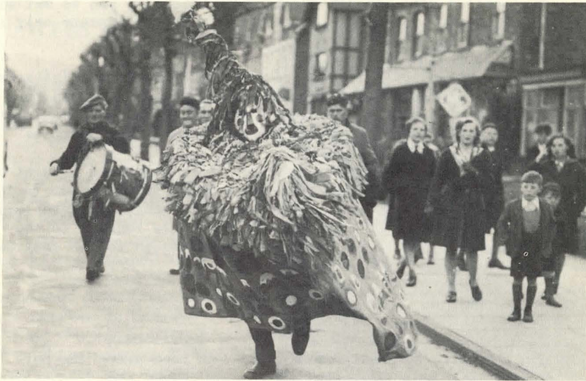
TRADITIONAL MINEHEAD HOBBY HORSE IN SOMERSET

MAYDAY is in the air and our thoughts turn to those customs that for many centuries and in many lands have been a sign to the people that new life has begun and that all promises well for a fruitful summer. The primitive calendar had only two seasons and the Coming in of Summer - the Festival of Beltane in the Celtic Tongue of Britain - was the great May fire festival which gave rise to most of the succeeding May celebrations, some of them stretching out to meet those of Midsummer. It had an octave, like our Church feasts today, and May 1st to May 8th was one of the highly magical periods of the year. Later, at what period we do not know, Winter and Summer Sun festivals were added to the first two-season Calendar and the year divided itself into quarters.* Today, the Pueblo Indians are divided into the Winter and Summer People, each group having general supervision of the ceremonies of its respective season.