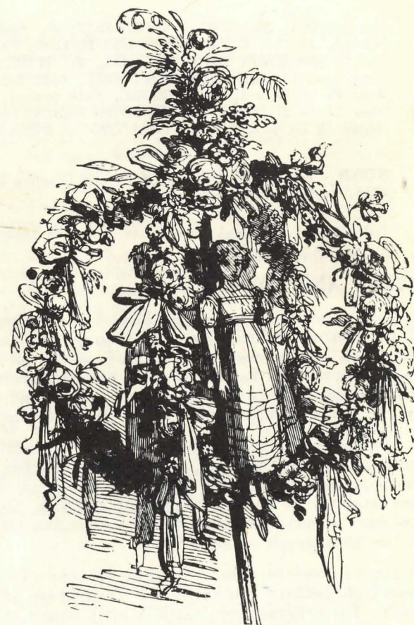
Northampton May Garland.