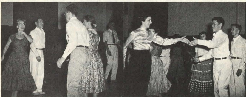
Scenes from evening Country Dance party at Cambridge Weekend