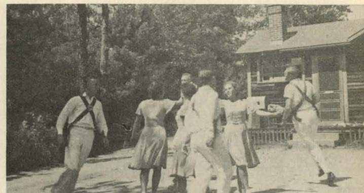
Country Dance - "Newcastle"