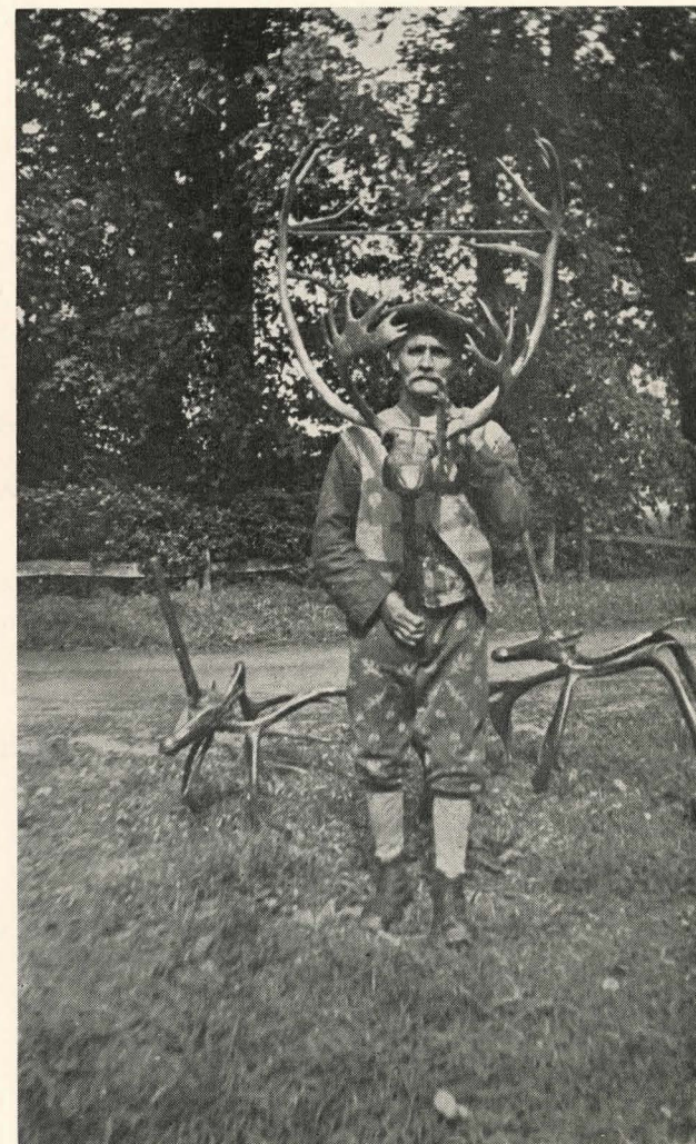
HORN DANCE LEADER