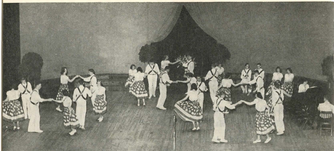
"Oranges and Lemons" at National Folk Festival Danced by Catholic High School Group from Fort Madison, Iowa