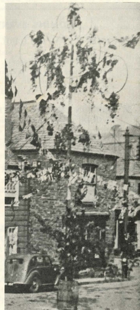
Maypole at Padstow, Cornwall