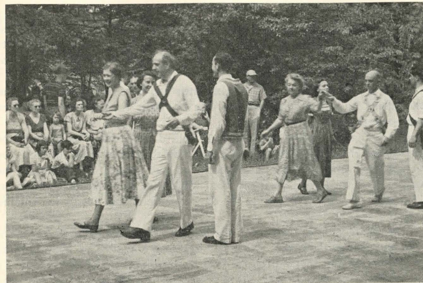
A COUNTRY DANCE AT THE NEW JERSEY FESTIVAL

take part in a program of English country, American square and contra dances. Enthusiasm was shown for all types of dances on the program, and the able leadership of teachers, callers and musicians made the day a success. About 6 p. m. "time out" was called, to give everyone a needed rest and a chance to replenish their diminishing energies with more calories! After supper, a few hardy souls again started dancing, informally and spontaneously, to records. This was still going on when the writer left, somewhat regretfully, about 8:30. There was no doubt about it—a good time was had by all!