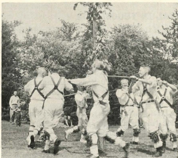
SWORD DANCE AT THE NEW JERSEY FESTIVAL

New York and New Jersey dancers gave a demonstration of Playford dances, new to many spectators. Afterwards, the audience was invited to