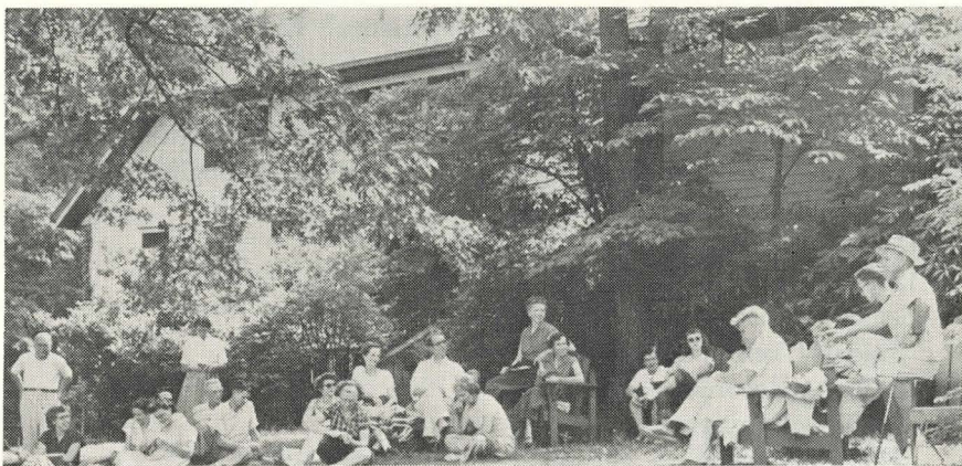
County agent, extreme right, and a group before farm tour at Brasstown