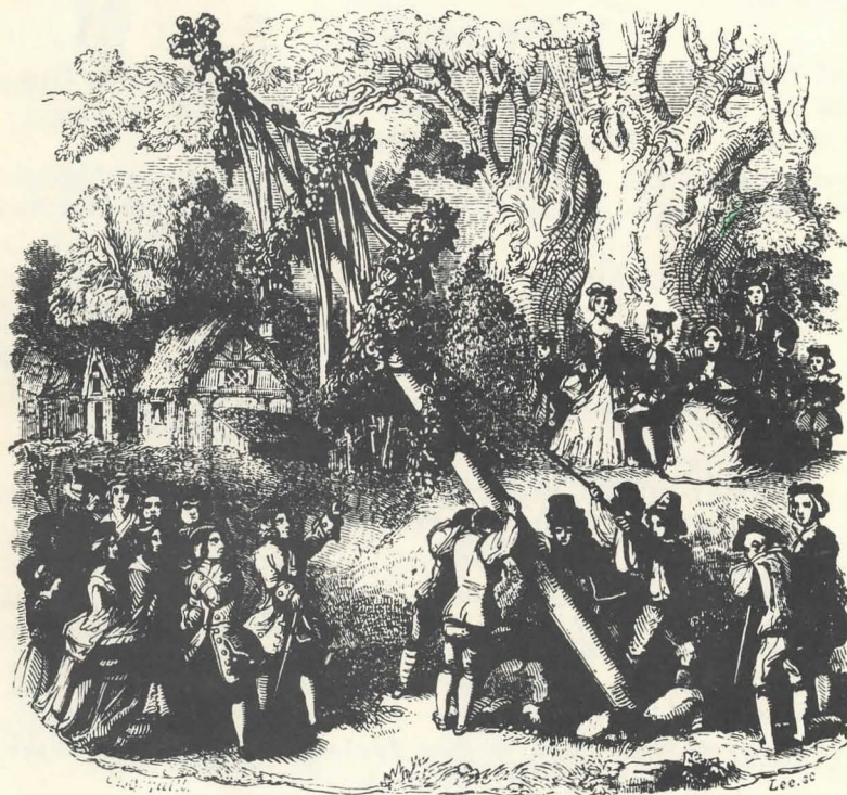
RAISING OF THE MAY-POLE.